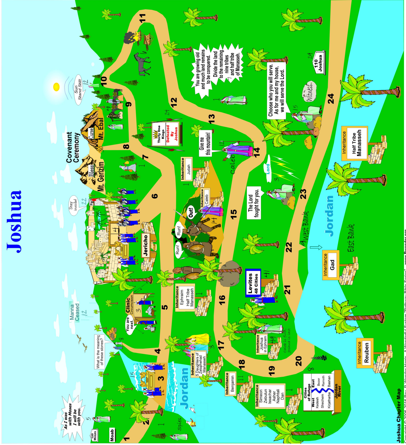
Joshua Chapter Map